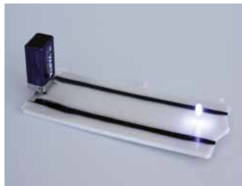
Demonstrator for conductive paths of electrically conductive composite produced by 2-K injection moulding