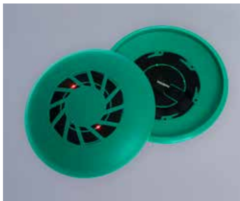
Top: LED with 3D printed conductive paths of electrically conductive composite

These enable electrically-conductive composites with a significantly lower filler concentration than, for example, is the case with carbon black. The flowability of the melt as well as the mechanical properties of the composite are consequently less affected than in cases where other conductive fillers are used.